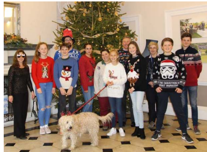
CHRISTMAS Jumper Day at Seaford College was a great success! Even our four-legged friend Coco got involved and wore her flashing Santa collar.