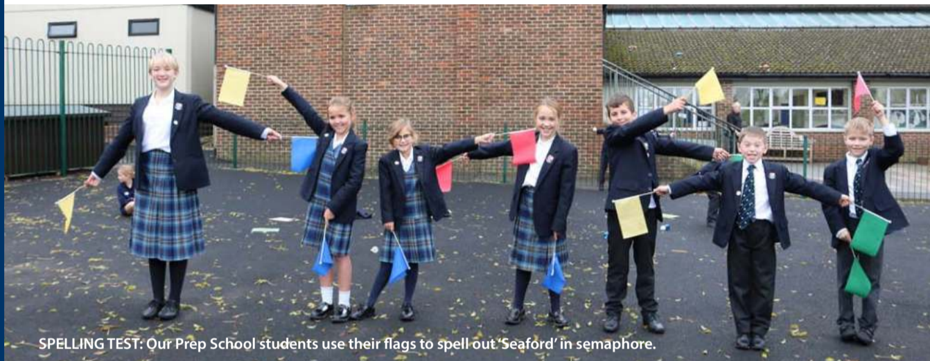
SPELLING TEST: Our Prep School students use their flags to spell out 'Seaford' in semaphore.