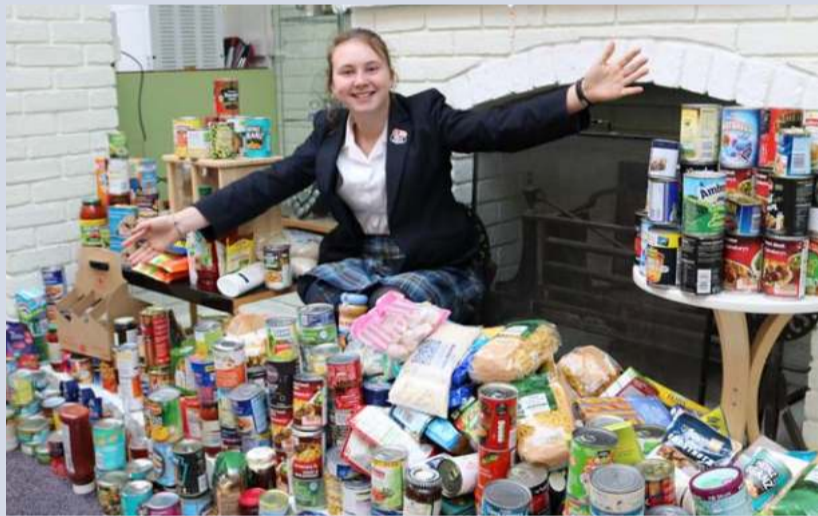
A BIG thank you to everyone who contributed so generously to the Harvest Festival. The wonderful collection of food made its way to the school's chosen charity, Chichester-based, Stonepillow. Right, cakes galore at the Macmillan Coffee Morning.

He says on his fundraising page: "My name