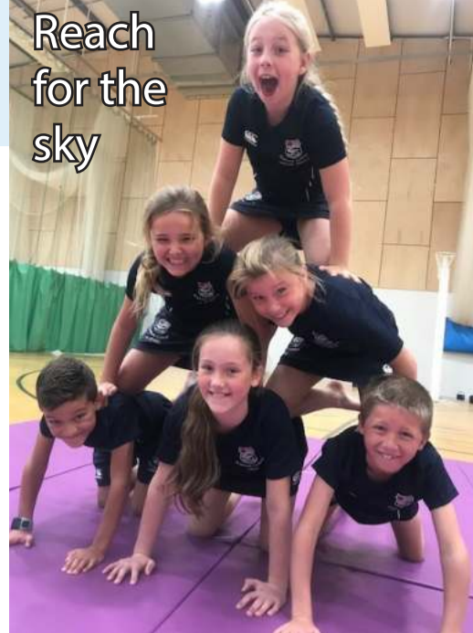
IN gymnastics, pupils were looking at individual and team balances, different methods of travelling and the importance of teamwork. Here some of Year 5 are having fun demonstrating pyramids.