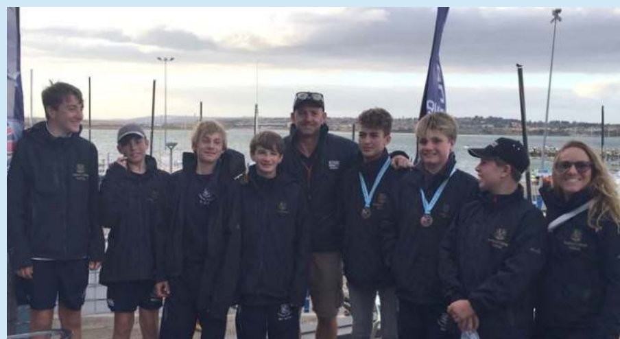
COMING ALONGSIDE: Seaford sailors at Weymouth meet up with Ian Walker – double Olympic medallist, America's Cup sailor, three-time Volvo Ocean Race competitor and the first British skipper to win.